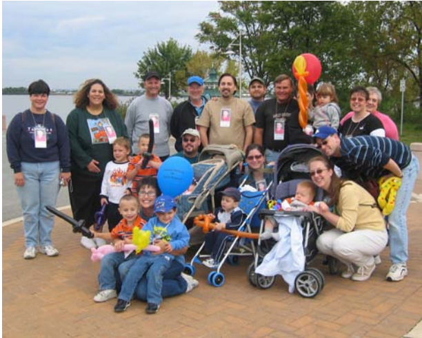
A Miracle for Mason 2006