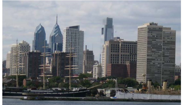
The view from the Battleship New Jersey at the September luncheon was amazing, as seen above. The Admiral Deck gave a perfect view of our friends across the river.